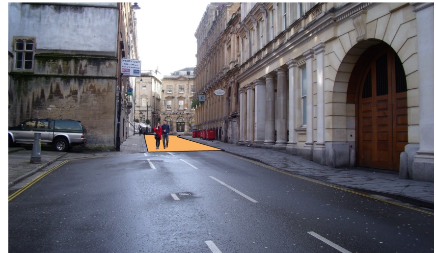
Small Street – pedestrianised background foreground could be remodelled as a shared space, allowing vehicles to turn